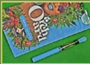
Product: 1 gram Mixed Berry Flavored Vape Pen at 78.66% THC for a total of 786mg THC.